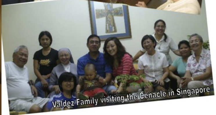
Valdez Family visiting the Cenacle in Singapore