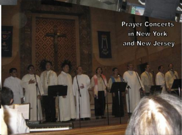
Prayer Concerts in New York and New Jersey