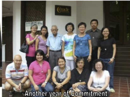
Another year of Commitment