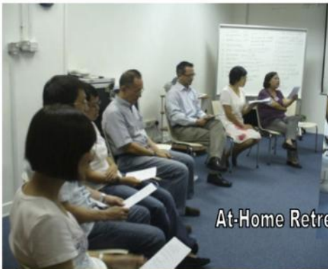
At-Home Retreat @ CANA