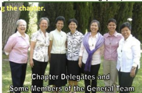
Chapter Delegates and Some Members of the General Team