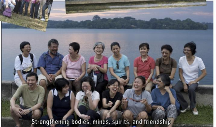
Strengthening bodies, minds, spirits, and friendship

God is good. God is more than good. God is Goodness. (St. Therese Coulerc) 1950