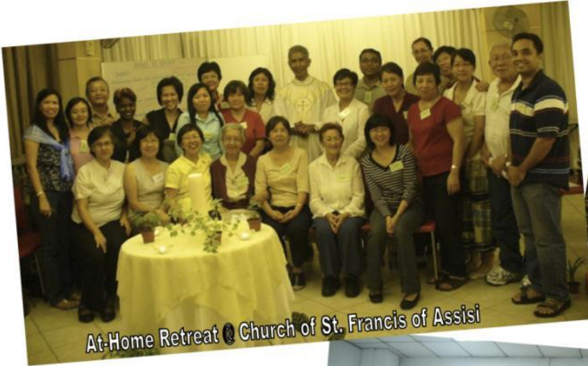
At-Home Retreat @ Church of St. Francis of Assisi

We are grateful for the many gifts of the year. Once again, through retreats and other spiritual programs, we are blessed to have walked with women and men of all ages in their journeys of faith. Our ministries are marked with opportunities for collaboration and partnership with our Cenacle Sisters and Affiliates, various religious congregations and lay friends.