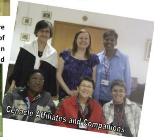
Cenacle Affiliates and Companions