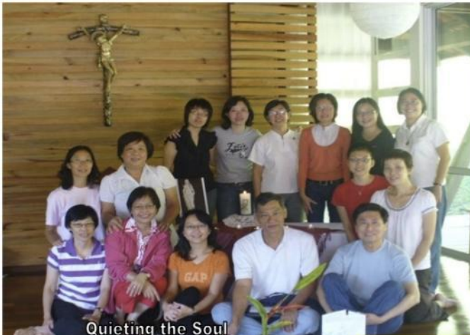
Quieting the Soul