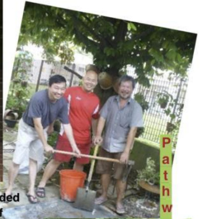
Pathway To Light

2010 for the Cenacle Affiliates in Singapore included various activities and projects. It was a year of launching a new website and they created a reflexology walkway in the Cenacle garden. The Affiliates set up a fund to support some students in Chiangmai, Thailand. Some of them were able to visit villages in Thailand to distribute food and clothing. Their monthly formation meetings at the Cenacle included sharing the task of facilitating the session. A day at the Seletar Reservoir Park strengthened not only their bodies, minds and spirits but their bond as a community as well. They made their promises for another year of commitment on 3 October 2010.