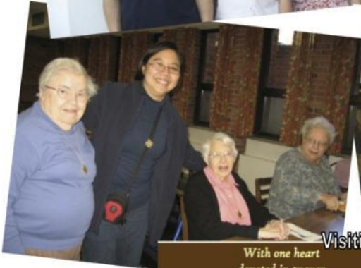
Visiting the Cenacle Sisters in Chicago